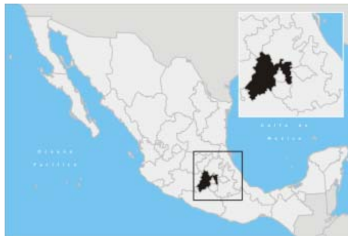
Location Map of Estado de México

Estado de México covers an area of over 22,000 km 2 , has a population of 15 million people and contributes 9.7% to the nation's GDP.